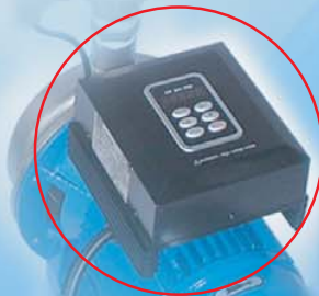
PID Controller with inverter